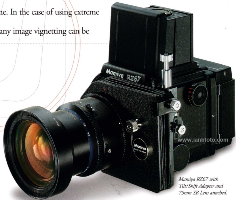
Mamiya RZ67 with Tilt/Shift Adapter and 75mm SB Lens attached.

expands the image control capabilities of the Mamiya RZ system. Previously, similar effects could only be effectively done with specialized, large view cameras. Now you can have the advantages of medium format quality and convenience, legendary Mamiya sharpness plus unique perspective and focus control. The Tilt/Shift Adapter maintains the ease-of-use, versatility, SLR viewing, and electronic functions of the RZ system, while adding exciting new creative control. It expands the RZ system and allows full use of all RZ film magazines, digital backs, and optional AE Finder and motor winder functions. In addition to SLR viewing, a precision Ground Glass Back Adapter is also available to check focus, depth-of-field, composition and perspective effects on the film plane. In the case of using extreme lens movements, all adjustments, and any image vignetting can be observed on the ground glass.