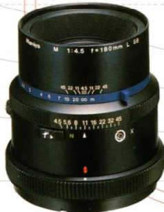
180mm SB Lens

Mamiya's legendary RZ lens system includes two specialized Short Barrel (SB) lenses which allow continuous focusing from infinity to close-up when attached to the Tilt/Shift Adapter. The 75mm SB and 180mm SB lenses are optically identical to the RZ series 75mm f/4.5 Shift and the 180mm f/4.5 W-N. They cover a wide image area and allow full use of the Adapter's capabilities.