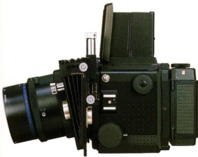
Vertical Tilt/Shift Down

The 75mm and 180mm Short Barrel (SB) lenses allow a complete range of focus from close-up to infinity for all architectural and landscape applications.