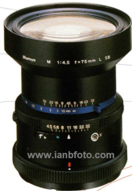
75mm SB Lens