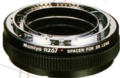
SB Auto Spacer