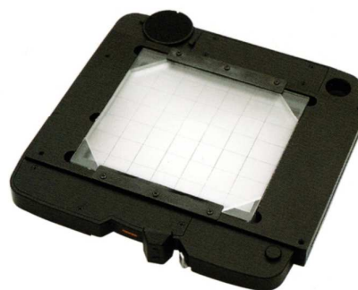
Ground Glass Adapter